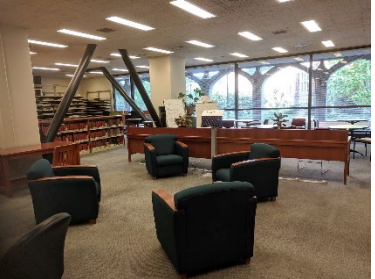
(Above) Three different layouts in the same area in GMM.